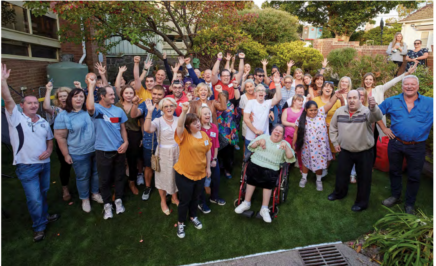
Celebrating our day on The Block