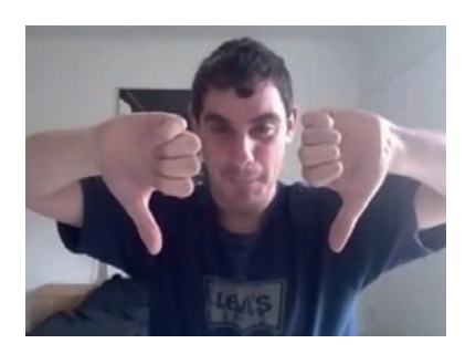
Say NO: to violence and abuse