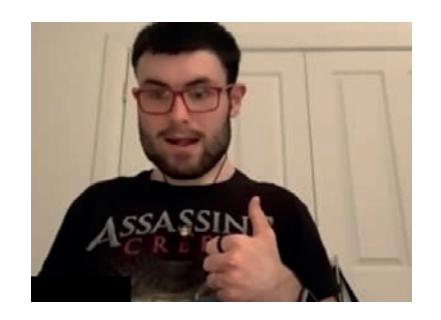
Say YES : to Respect, Freedom, Decision Making, Being Safe