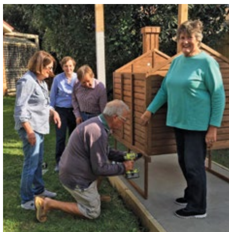
Members of the Rotary Club of Hampton put the finishing touches on the chicken coop