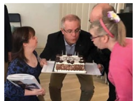
Clients help the Minister blow out the candles