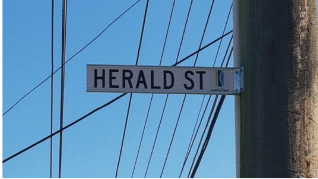
The move to Herald Street