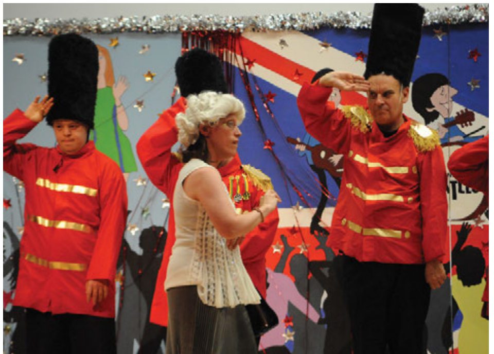
The Queen inspects her guards.