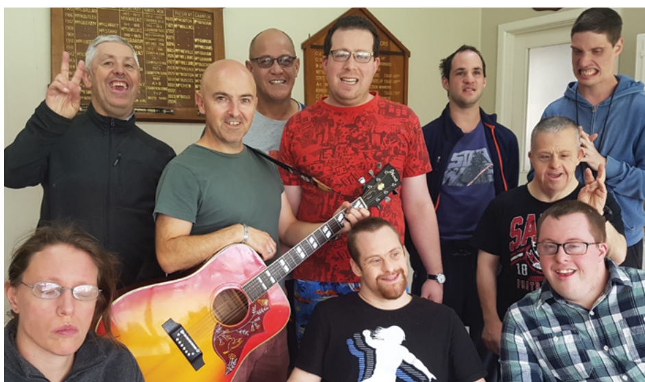
The song writing crew in action.

Visit entbook.com.au/1823x48 now for more information.