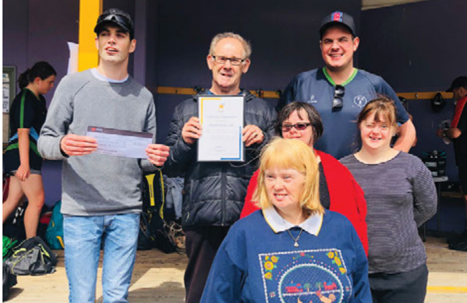
The residents of Roxburgh House accept the cheque.