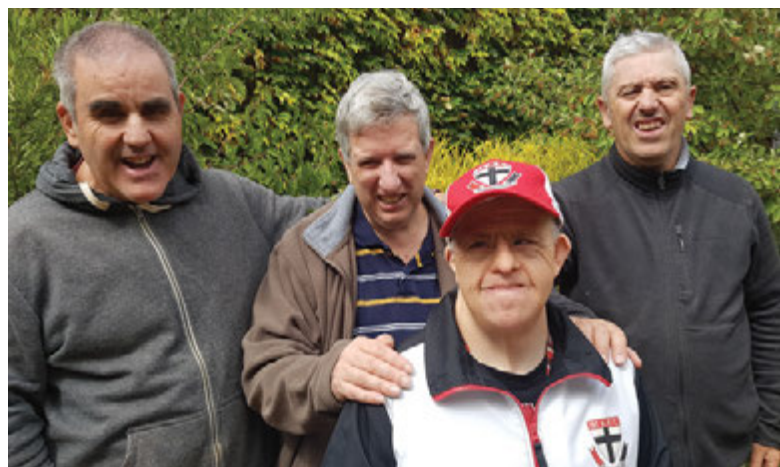
Our great gardening guys.